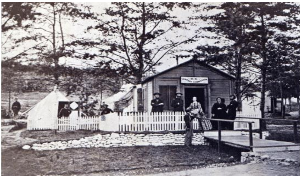
U.S. Sanitary Commission Lodge, 1863 Alexandria, Virginia

Led by an executive board overseeing inspectors and field agents, U.S. Sanitary Commission branches in larger cities coordinated the efforts of local aid societies. Some existing regional aid societies, including the WCAR, would serve under the U.S. Sanitary Commission. Not everyone liked the idea of taking orders from Washington. Some organizations continued to function more or less independently, such as the U.S. Christian Commission which provided relief to both sides. On July 4, 1865, the U.S. Sanitary Commission ended its work. The last official act was the publication of its history in 1866.