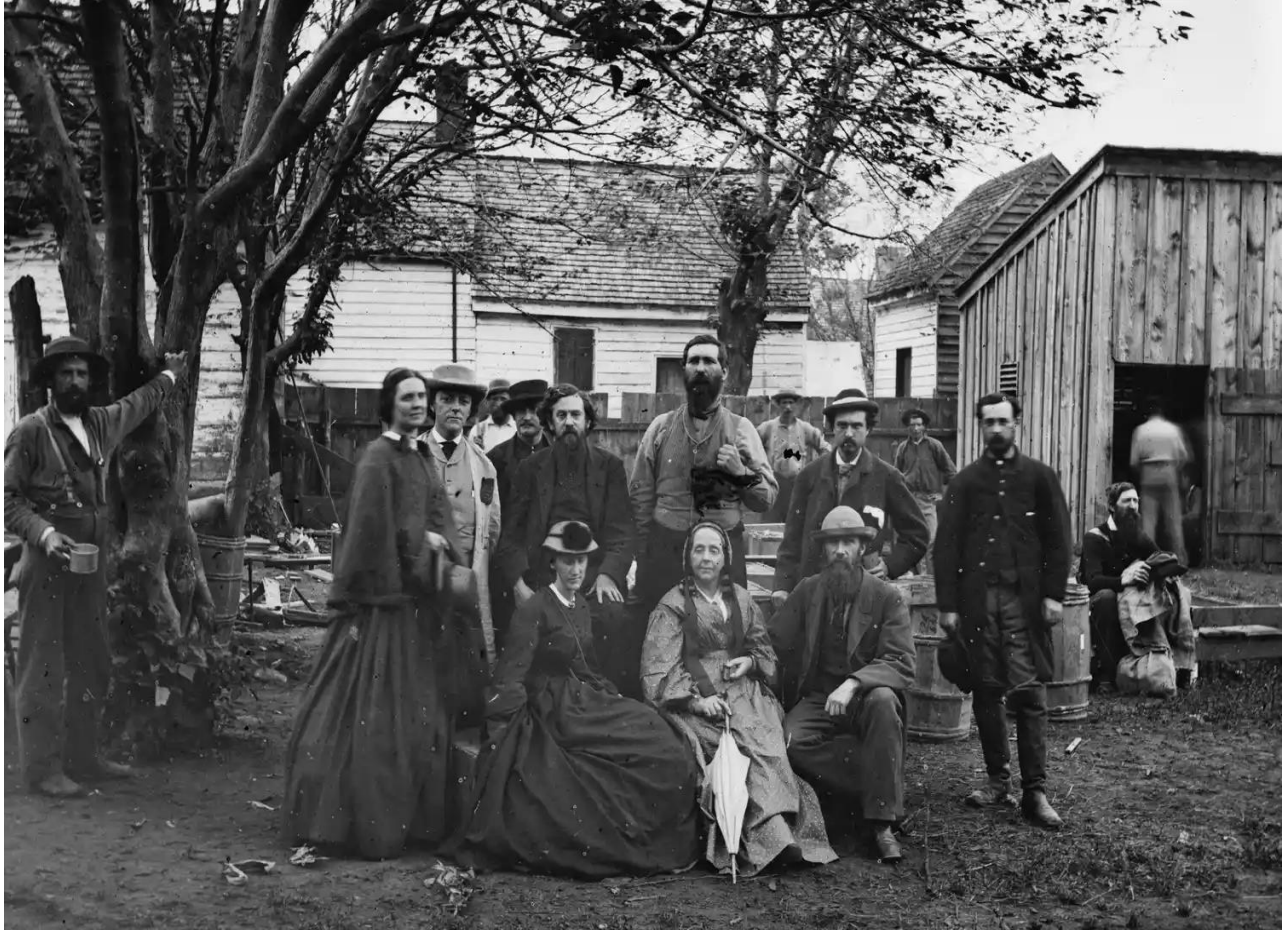
Nurses and officers of the U.S. Sanitary Commission. Picture taken in May of 1864 at Fredericksburg, Virginia.